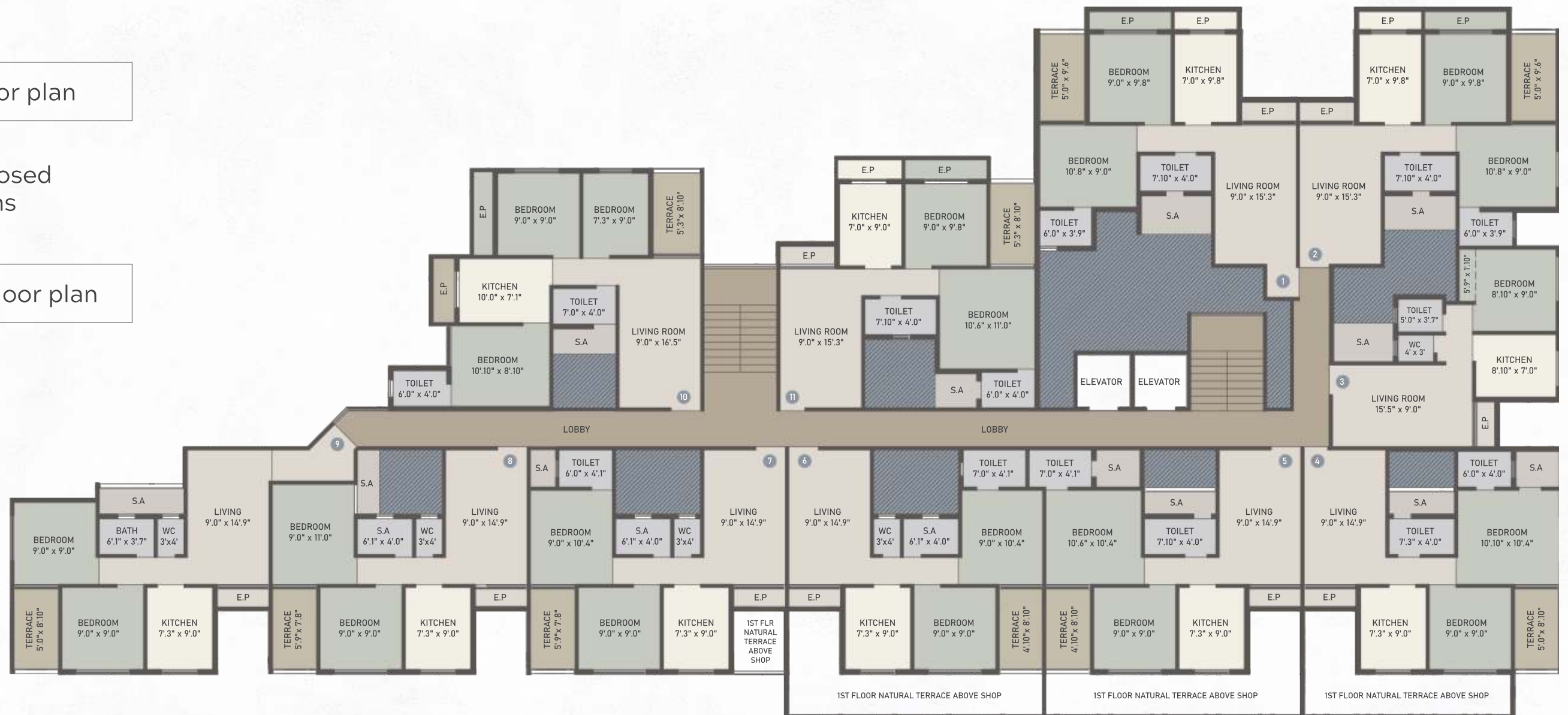
1st, 3rd, 5th & 7th floor plan