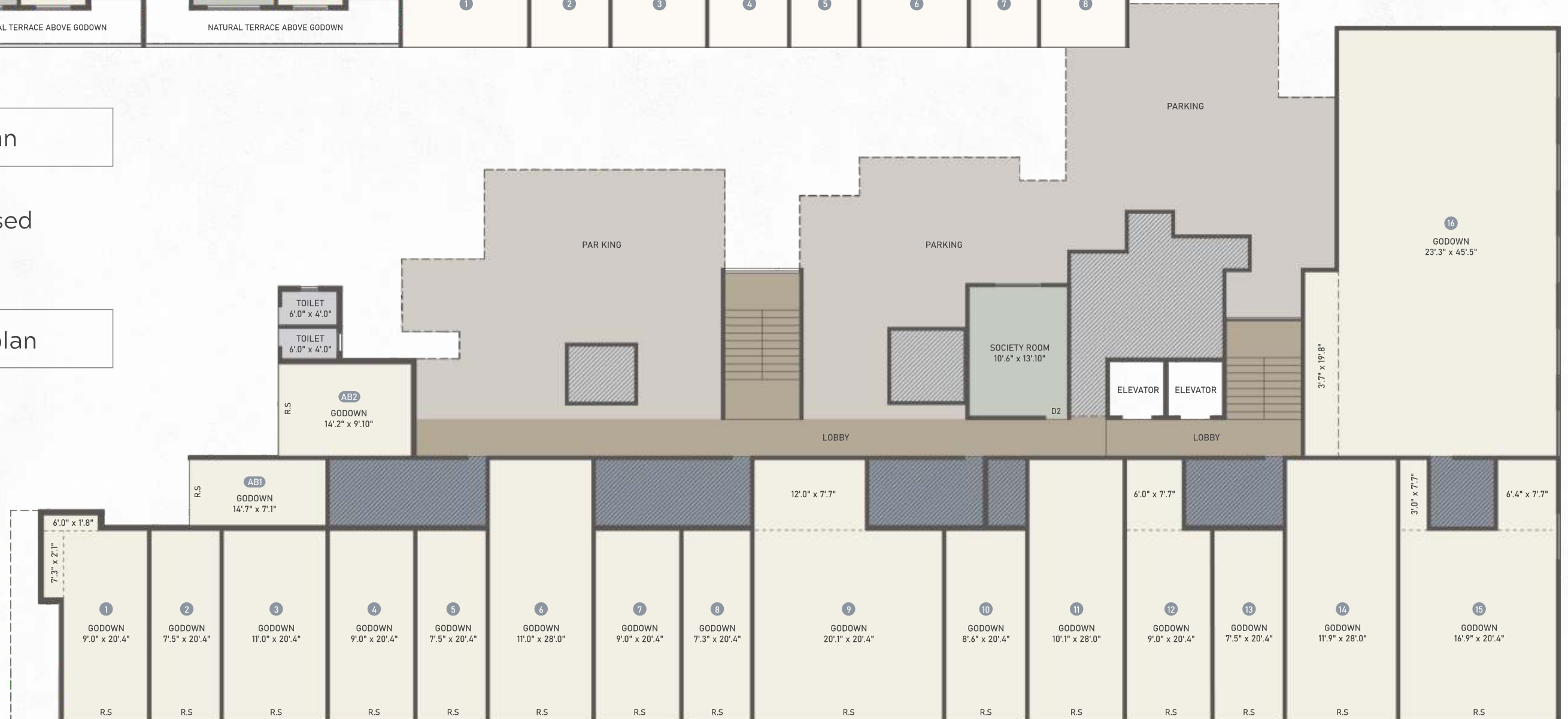
Basement floor plan