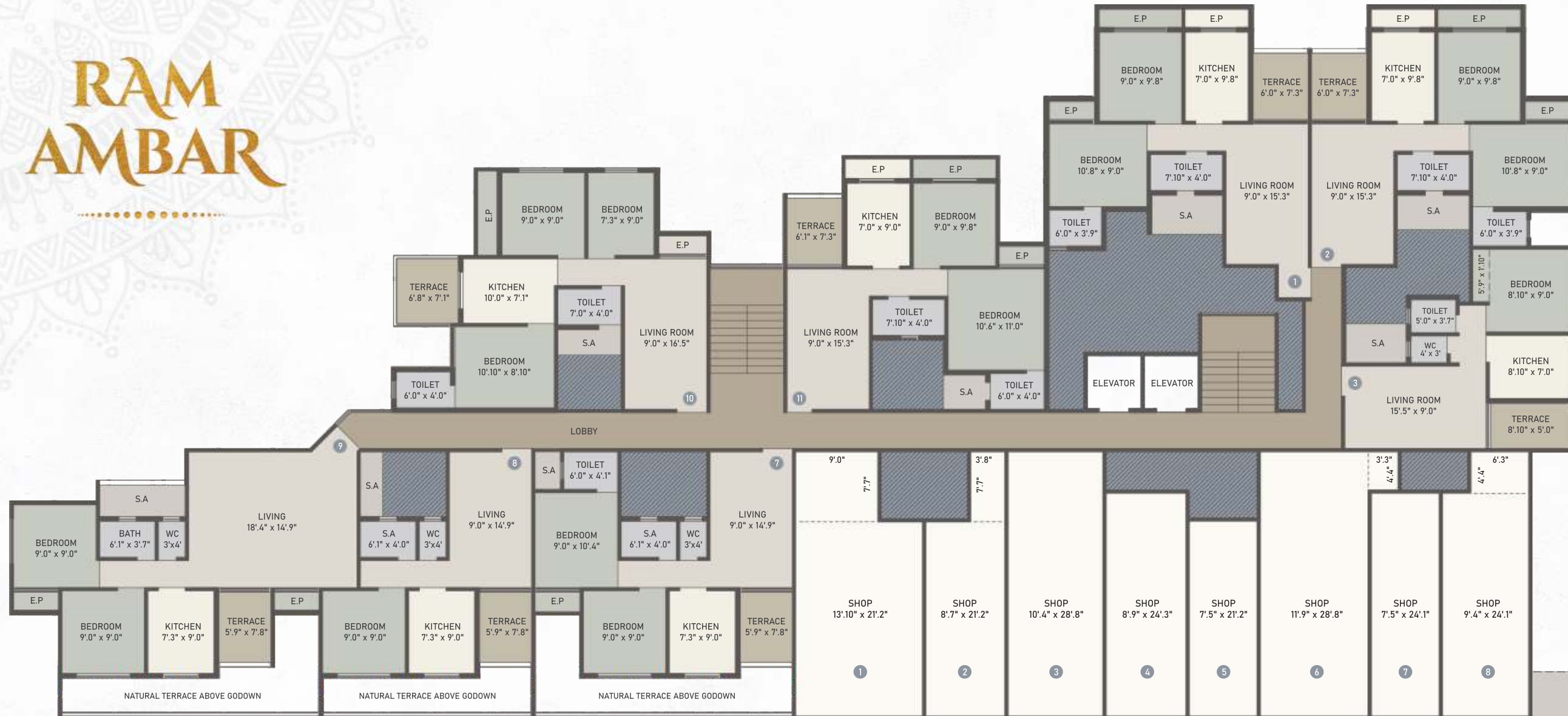
Type B Floor Plans