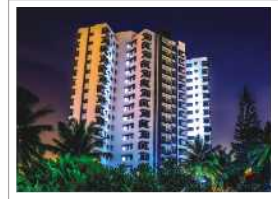
KUMAR PRINCETOWN ROYALE Near Jalahalli Metro Station