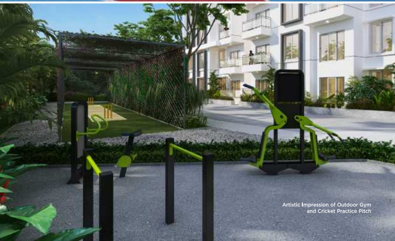
Artistic Impression of Outdoor Gym and Cricket Practice Pitch