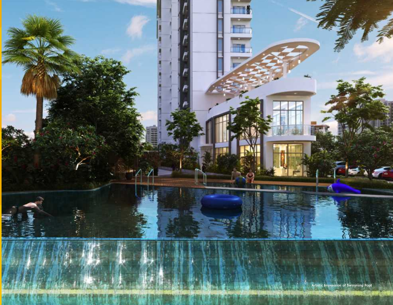
Artistic Impression of Swimming Pool