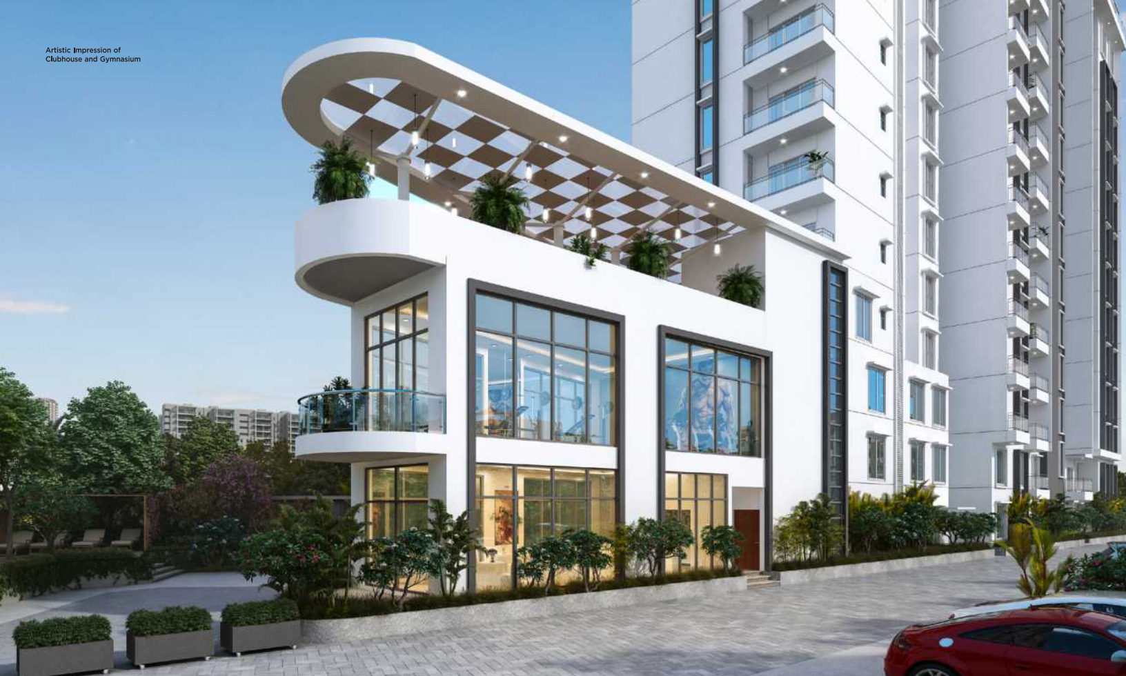
Artistic Impression of Clubhouse and Gymnasium