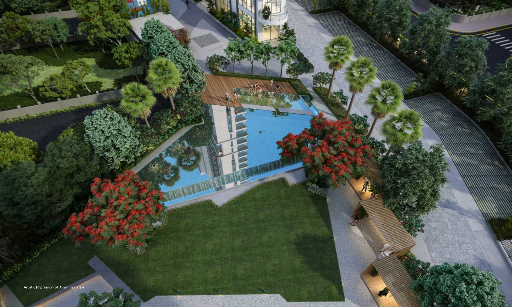
Artistic Impression of Amenities View