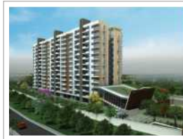
KUMAR PRINCEVILLE Mysore Road, Near RV College