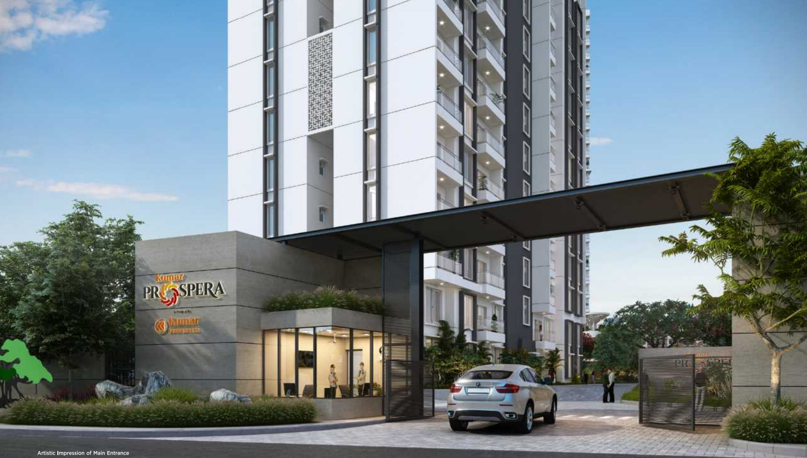
Artistic Impression of Main Entrance