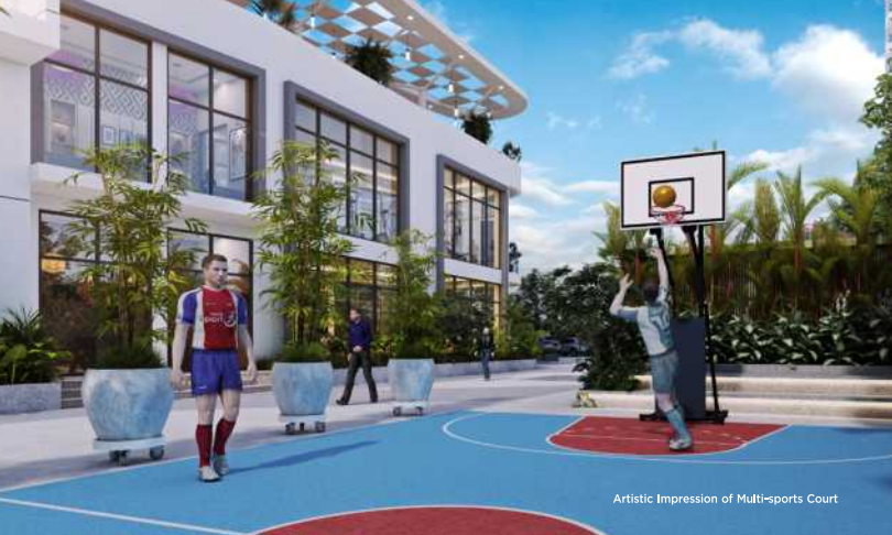
Artistic Impression of Multi-sports Court