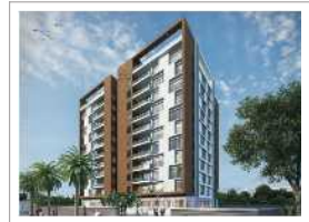
KUMAR KINO PLATINUM Sheshadripuram Main Road