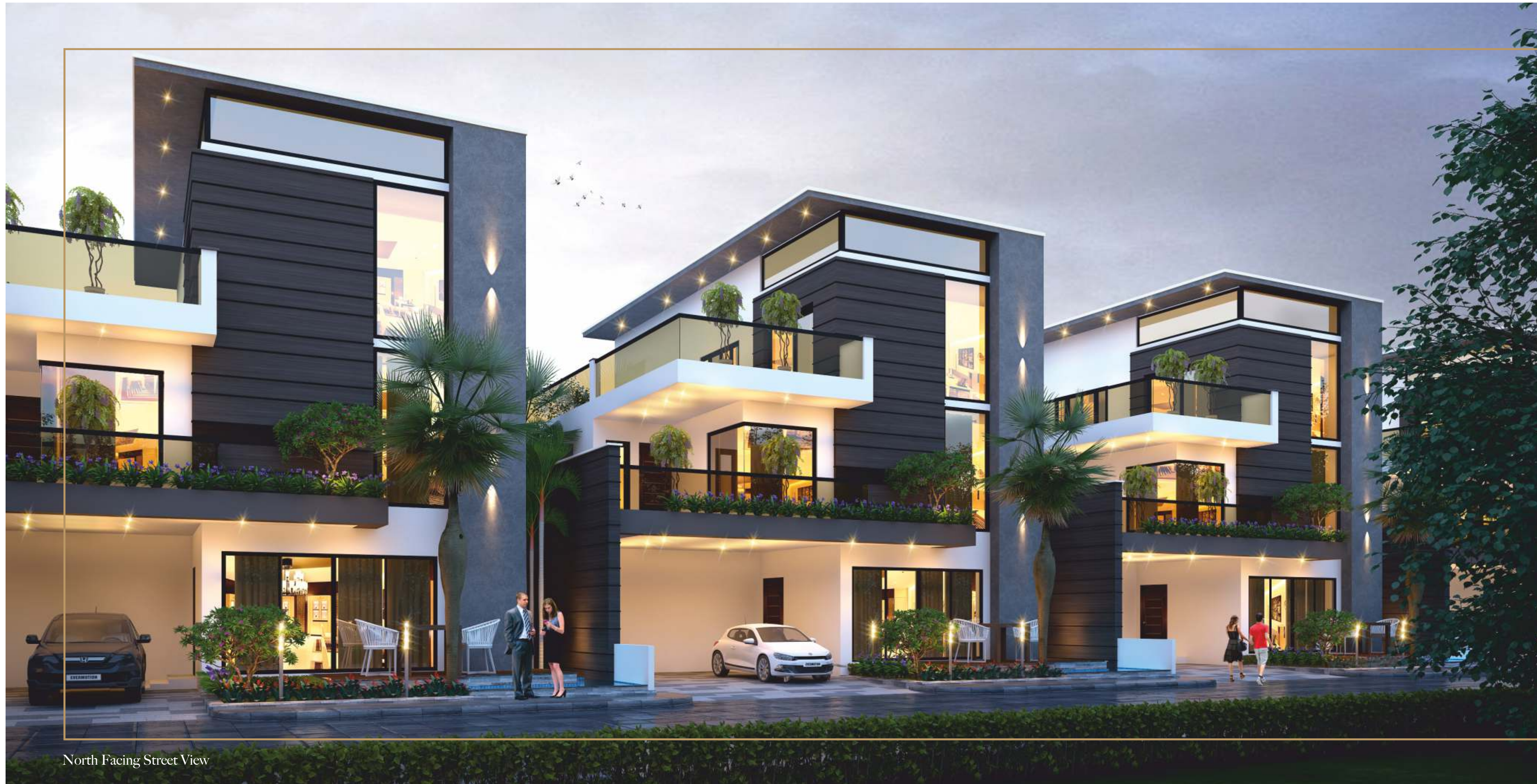
North Facing Street View