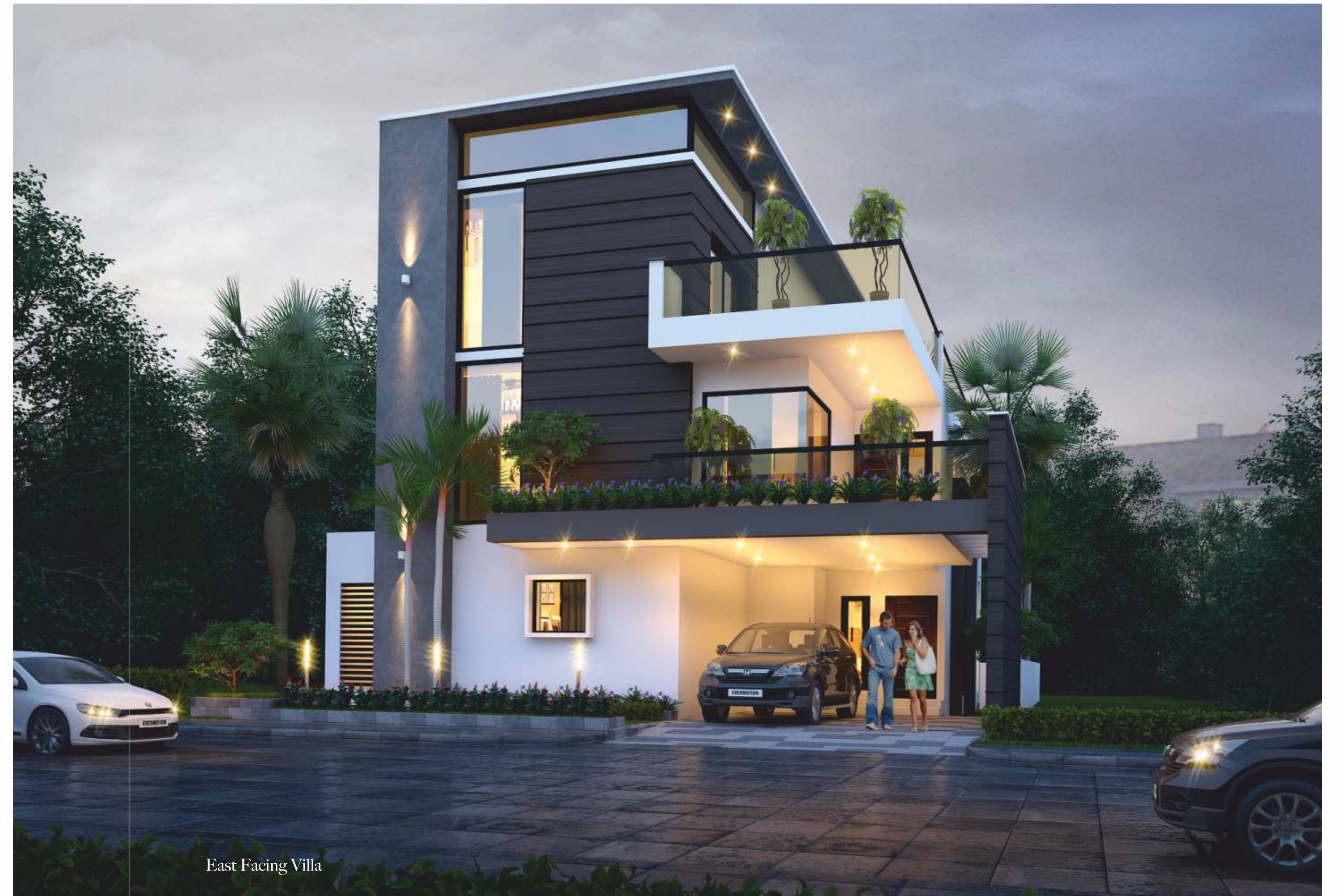
East Facing Villa