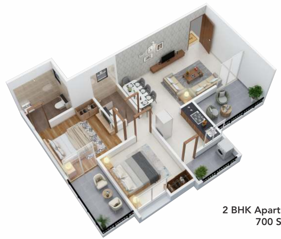
2 BHK Apartment 700 SQ.FT