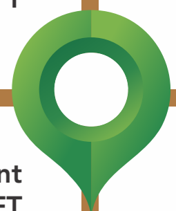
2 BHK Apartment 653 SQ.FT