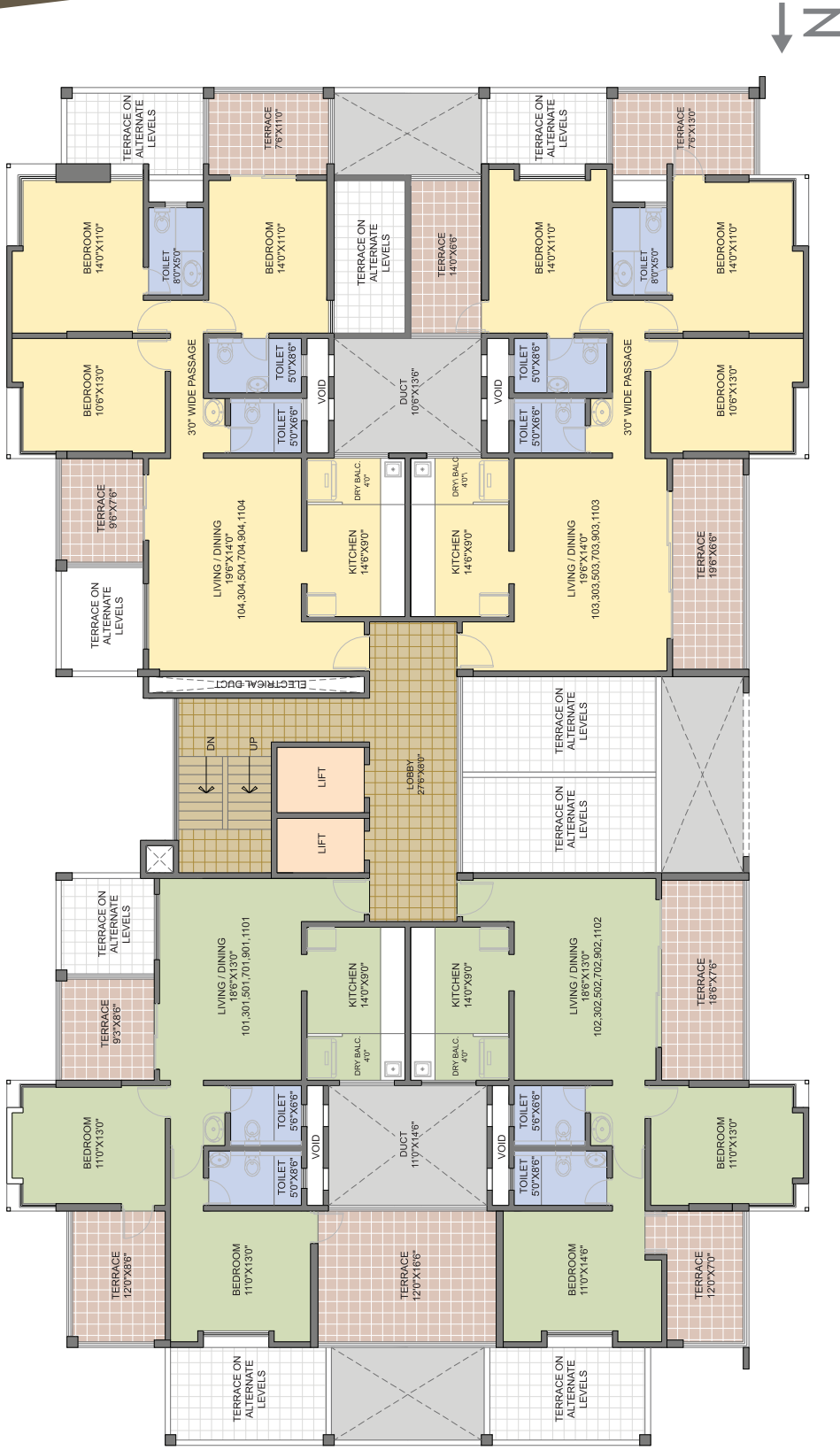
AREA STATEMENT (IN SQ.FT.) : BUILDING A FIRST, THIRD, FIFTH, SEVENTH, NINTH & ELEVENTH FLOOR