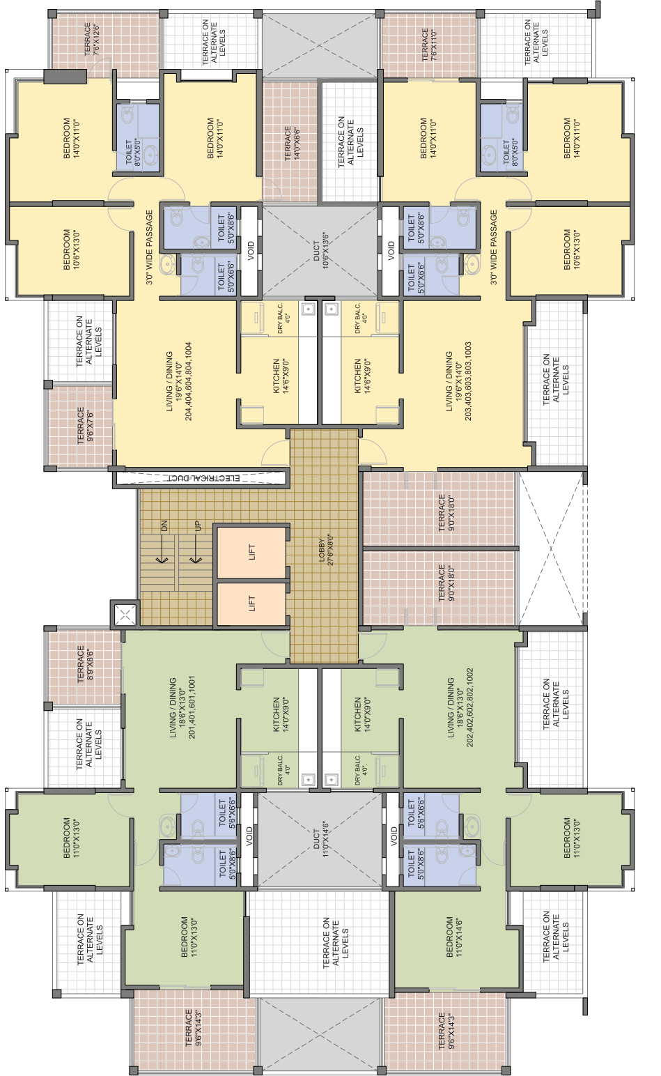
AREA STATEMENT (IN SQ.FT.) : BUILDING A EIGHTH FLOOR