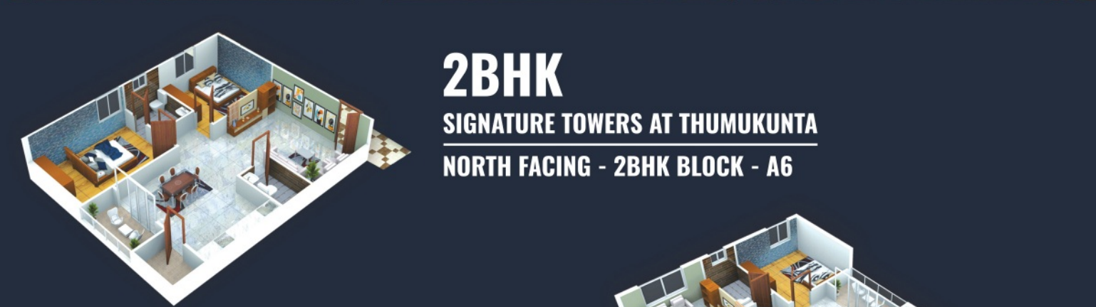
2BHK SIGNATURE TOWERS AT THUMUKUNTA NORTH FACING - 2BHK BLOCK - C16