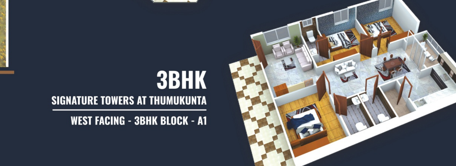
3BHK SIGNATURE TOWERS AT THUMUKUNTA WEST FACING - 3BHK BLOCK - A1