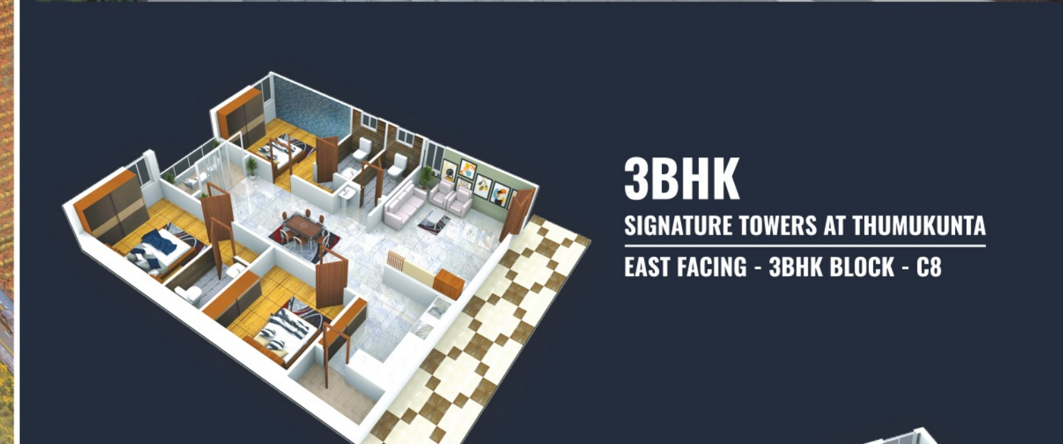
3BHK SIGNATURE TOWERS AT THUMUKUNTA EAST FACING - 3BHK BLOCK - C8