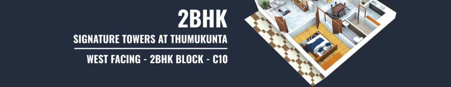
2BHK SIGNATURE TOWERS AT THUMUKUNTA WEST FACING - 2BHK BLOCK - C10