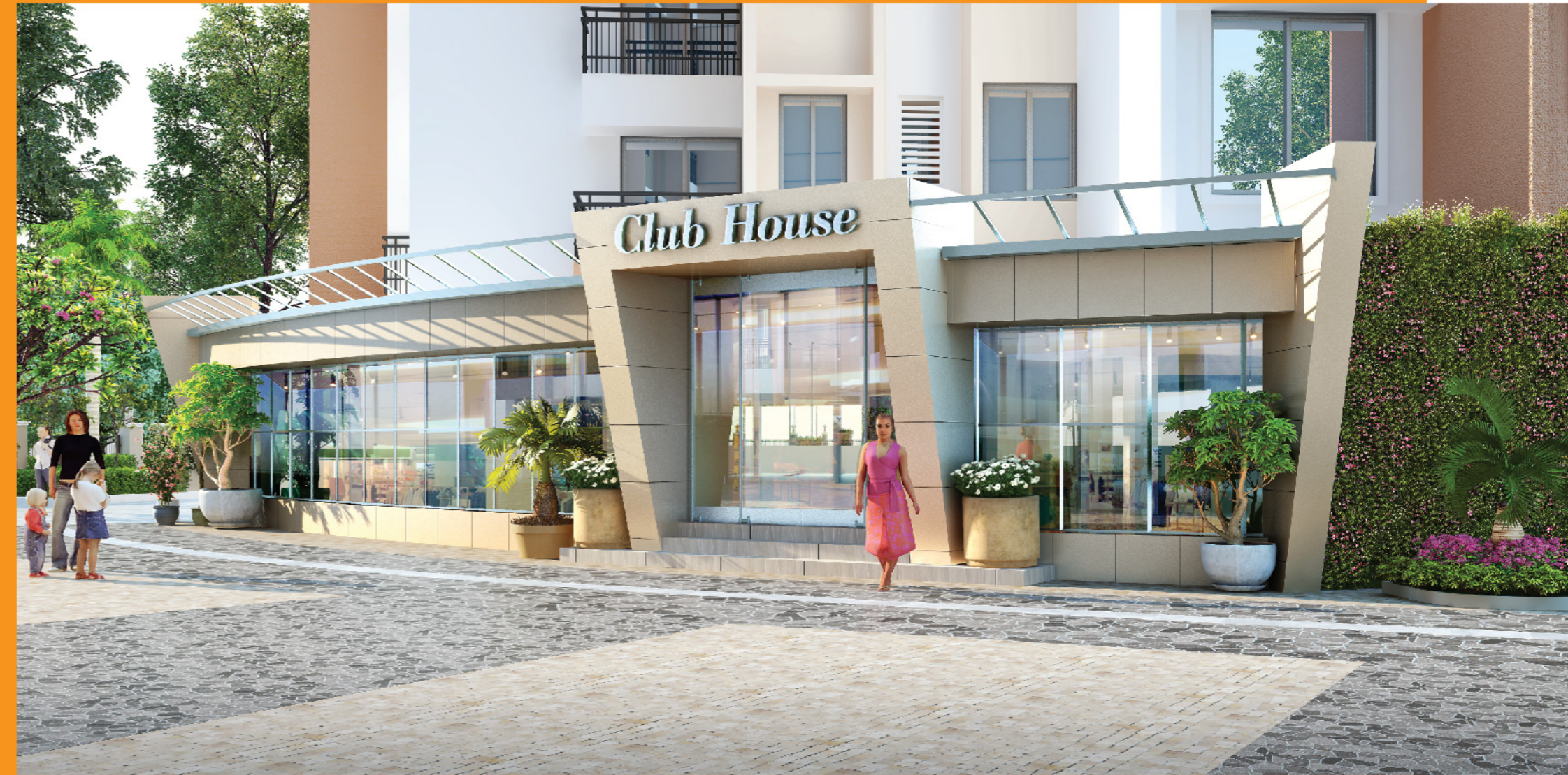
THE CLUB HOUSE