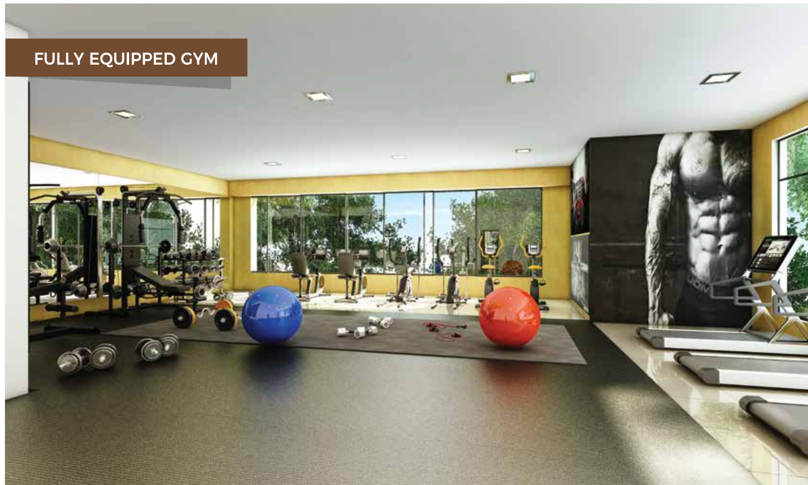
FULLY EQUIPPED GYM