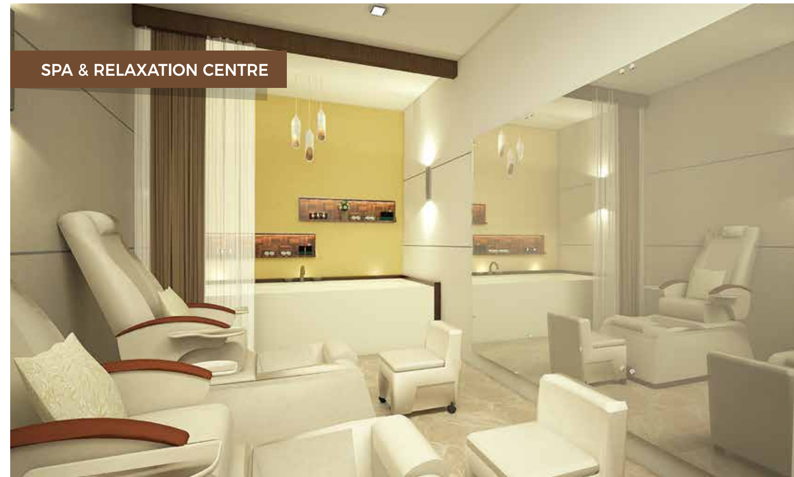
SPA & RELAXATION CENTRE