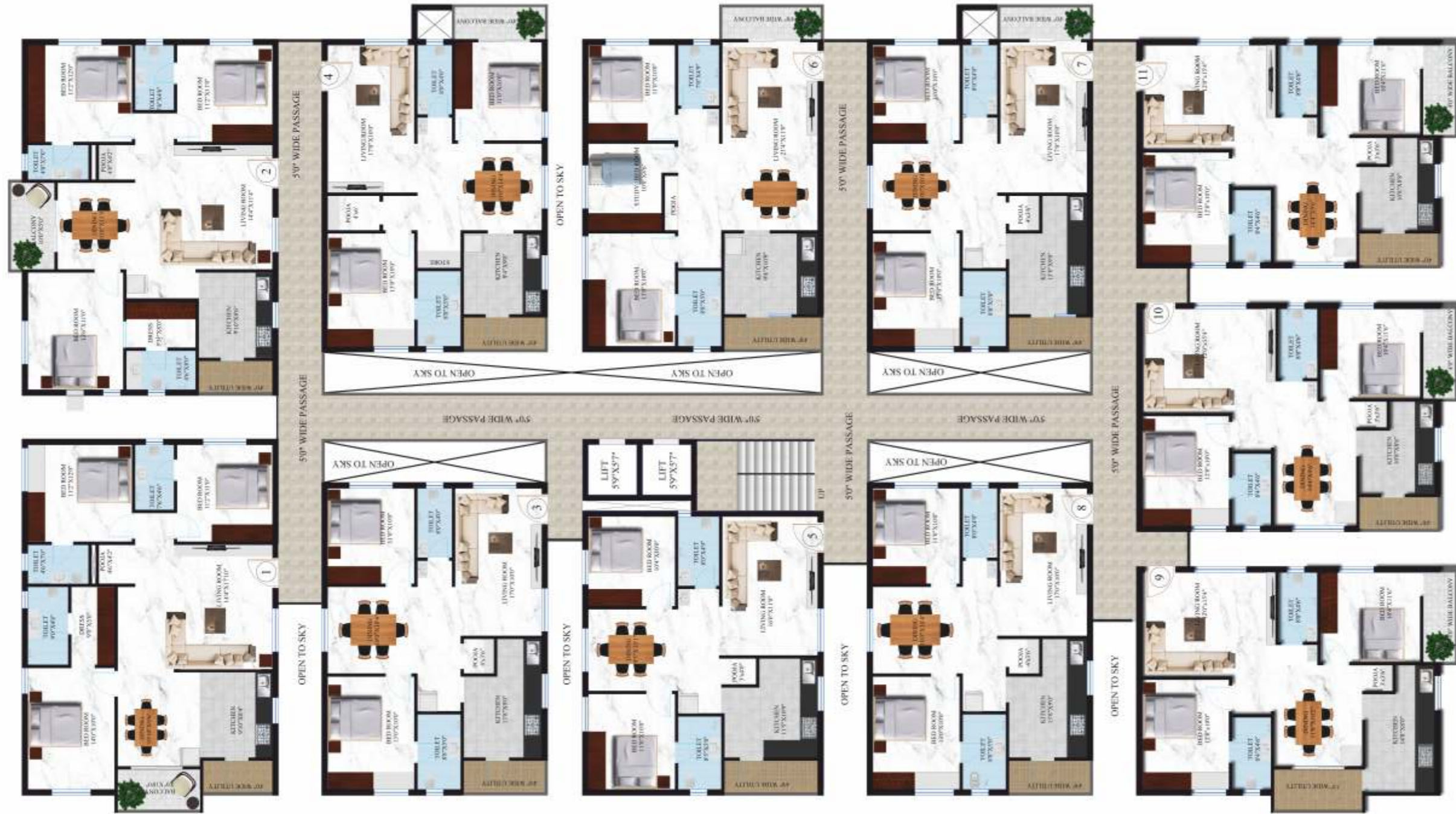
TYPICAL FLOOR PLAN (1st to 4th Floor)