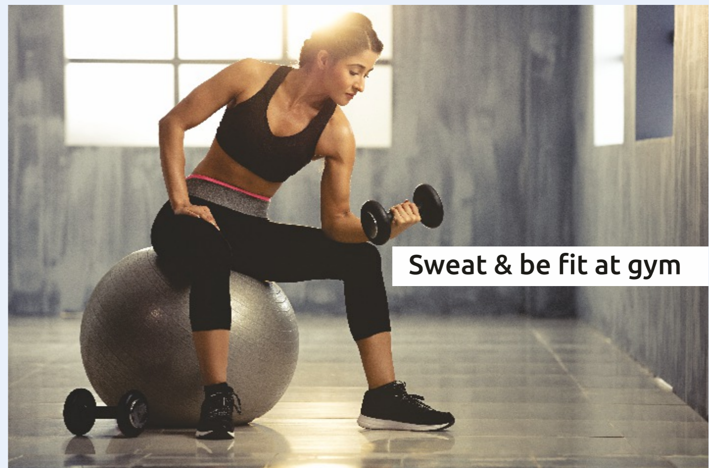
Sweat & be fit at gym