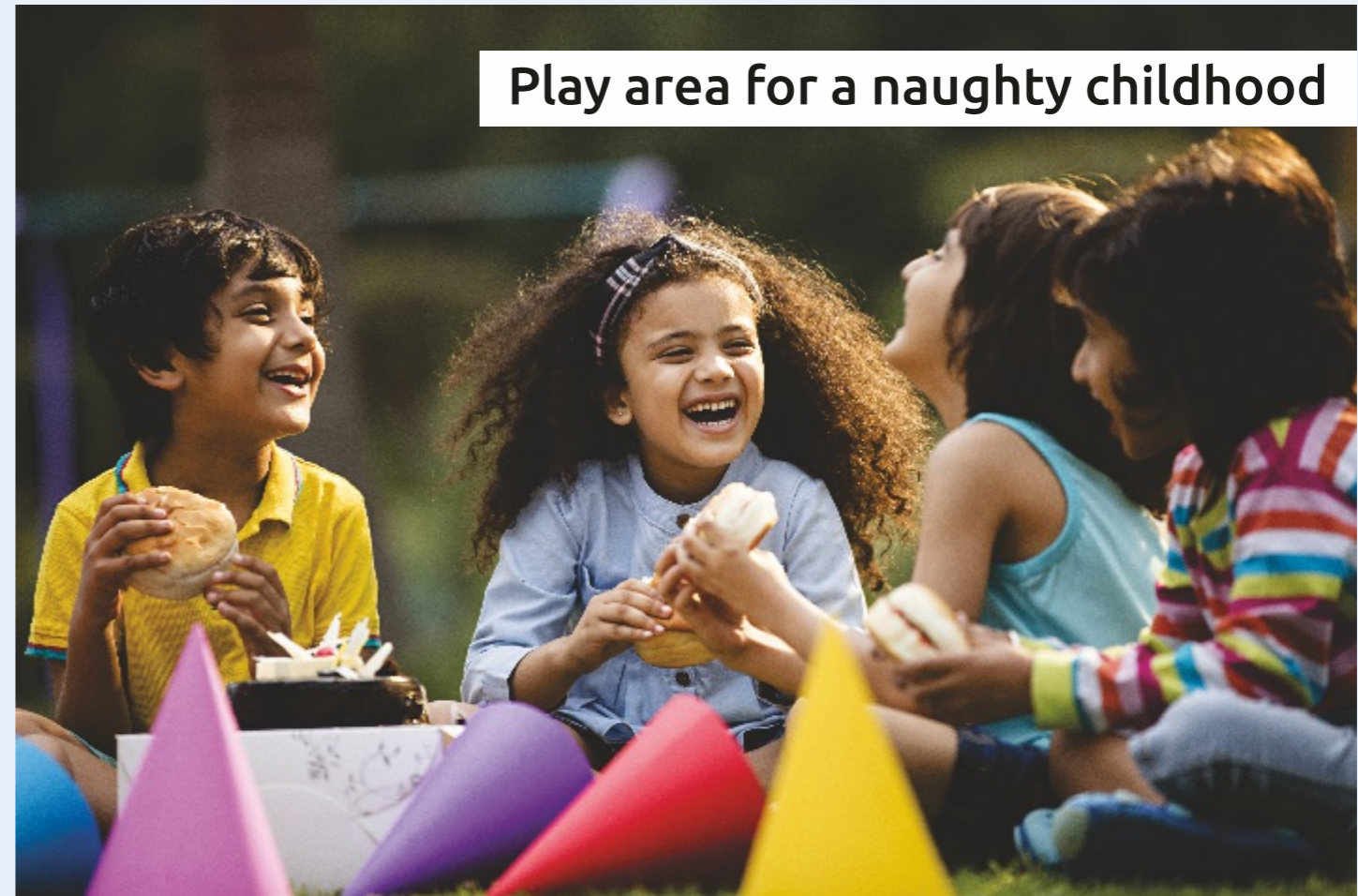
Play area for a naughty childhood