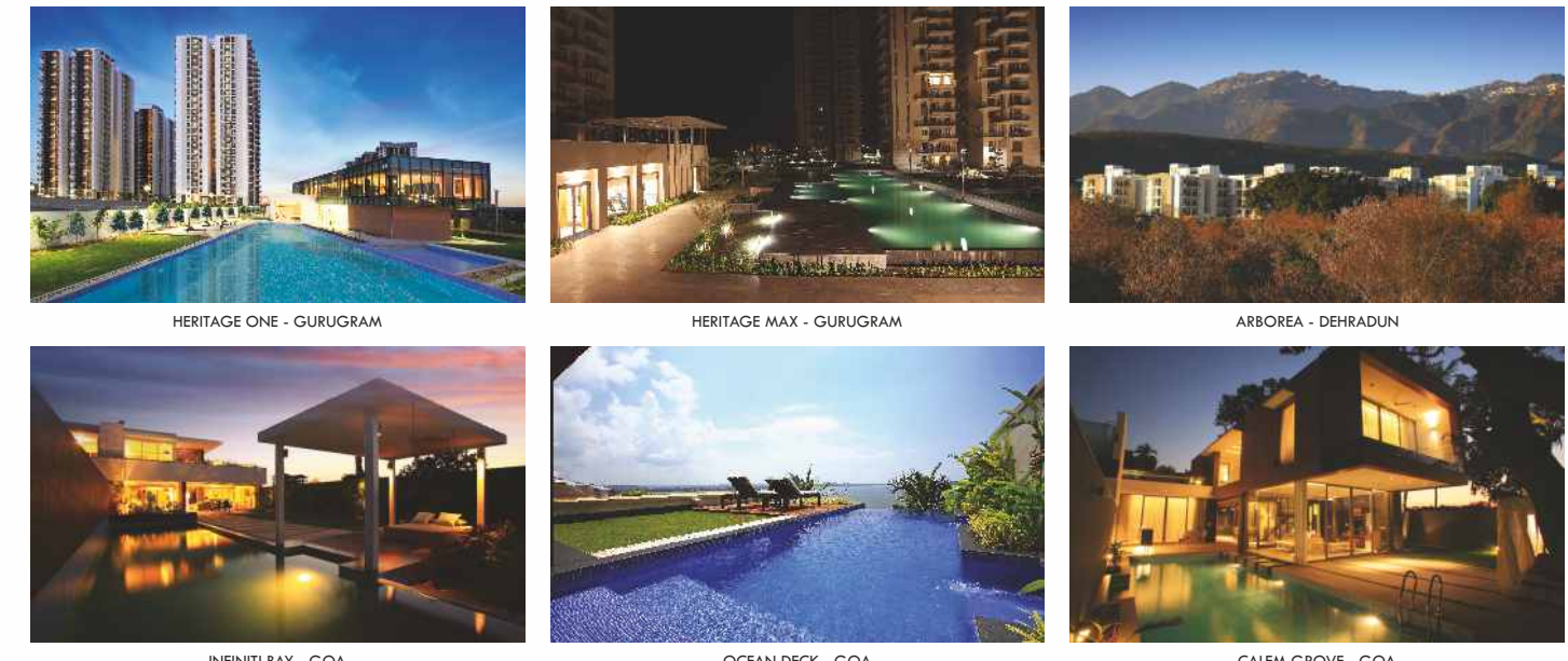
HERITAGE ONE - GURUGRAM HERITAGE MAX - GURUGRAM ARBOREA - DEHRADUN INFINITY BAY - GOA OCEAN DECK - GOA CALEM GROVE - GOA