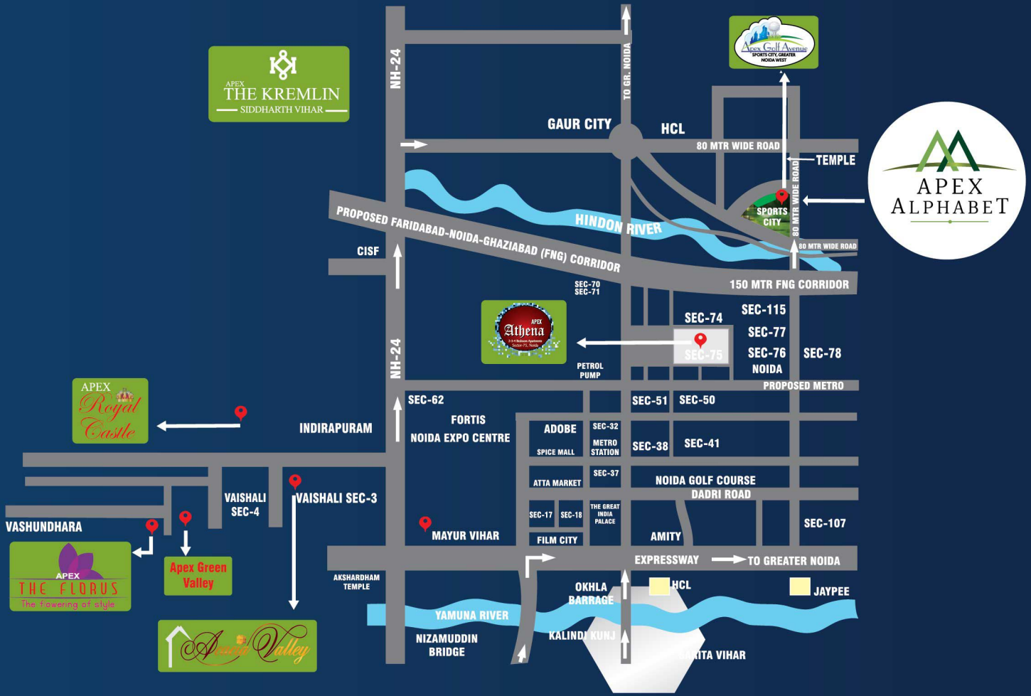
Location map not to scale

Apex Alphabet is strategically positioned to enjoy advantages accruing from its great location that boasts of an incredibly smooth connectivity to prominent areas in and around NCR. This location is the central point Noida, Ghaziabad and New Delhi.