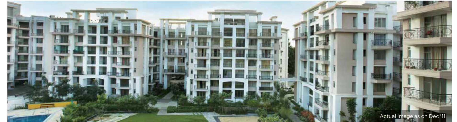
Actual image as on Dec '11