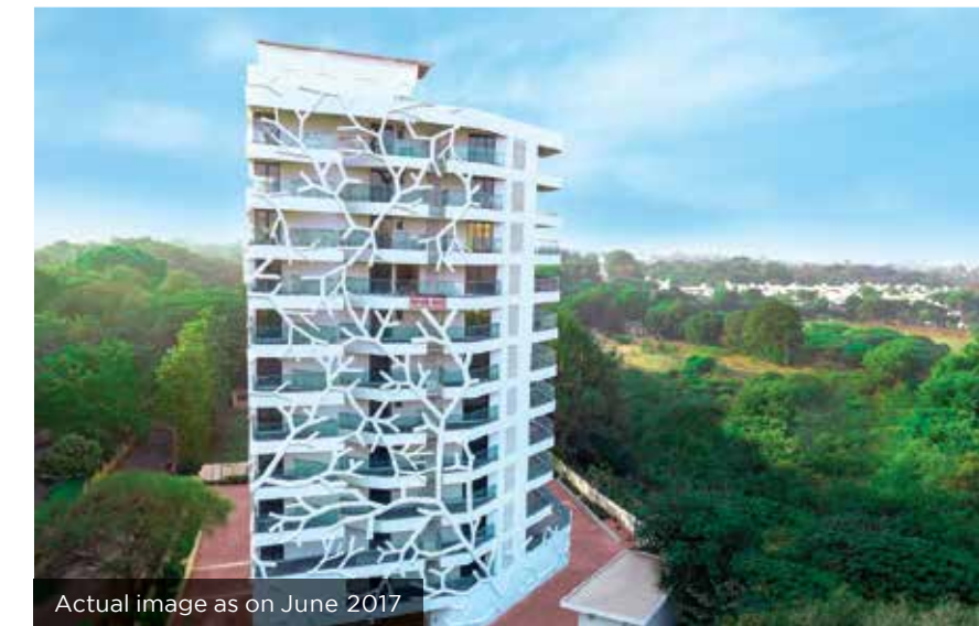
Actual image as on June 2017