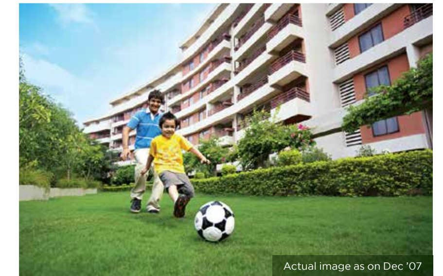
Actual image as on Dec '07