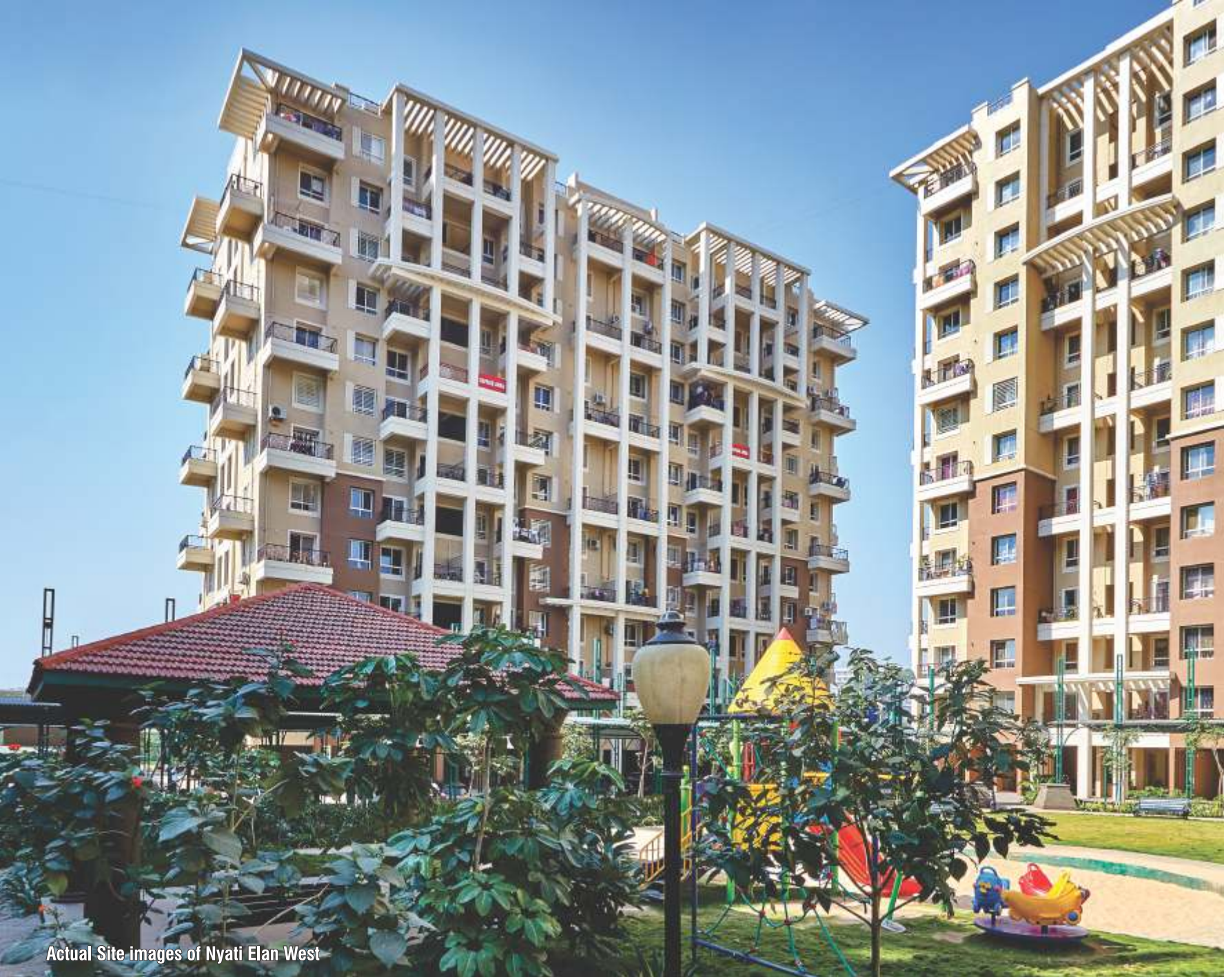
Actual Site images of Nyati Elan West