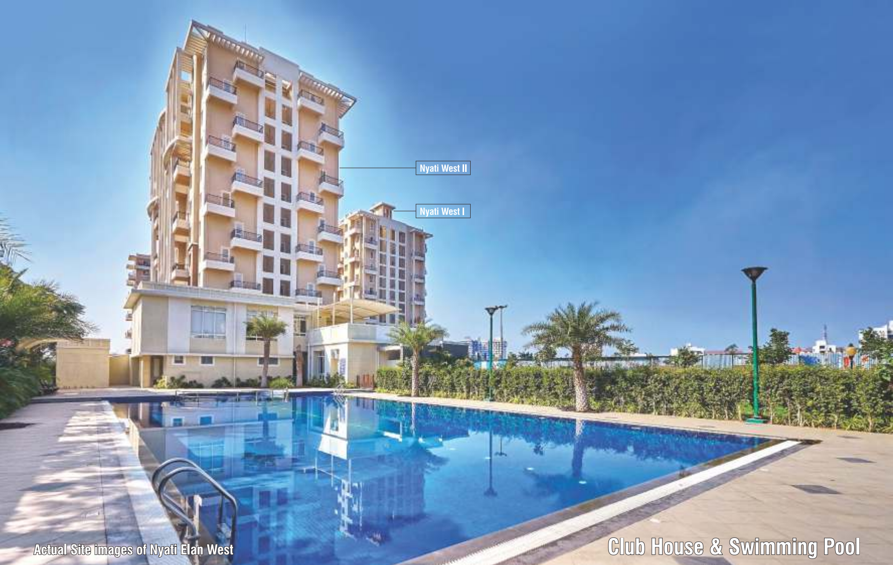
Actual Site Images of Nyati Elan West