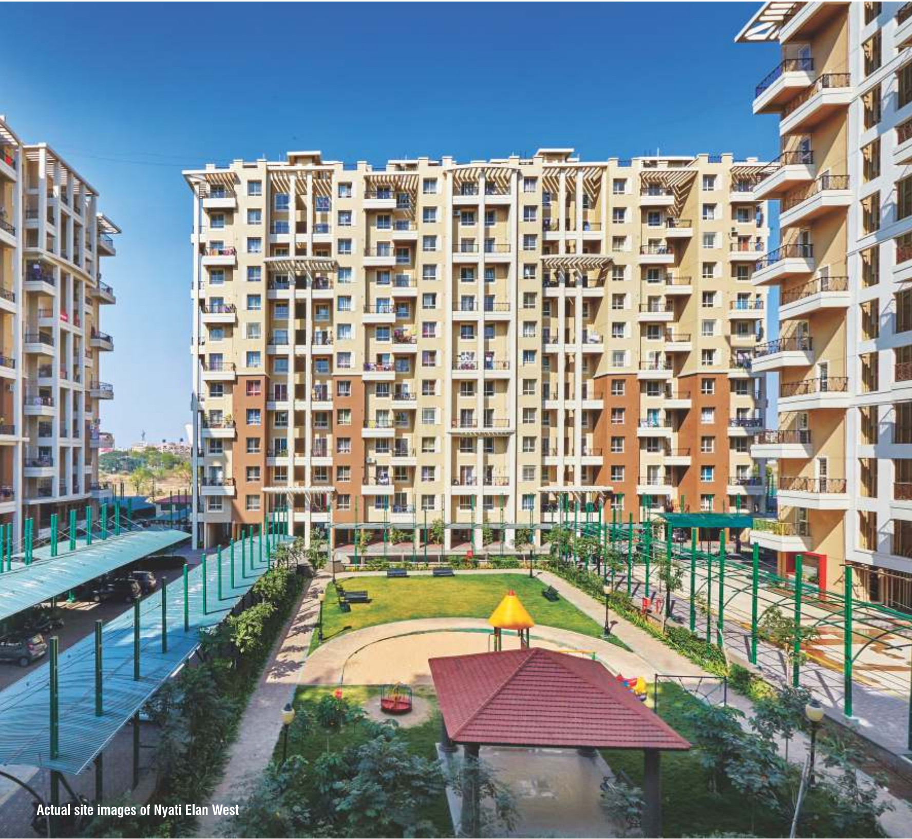
Actual site images of Nyati Elan West