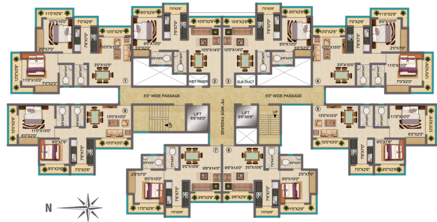
Typical Floor Plan (2nd-17th)