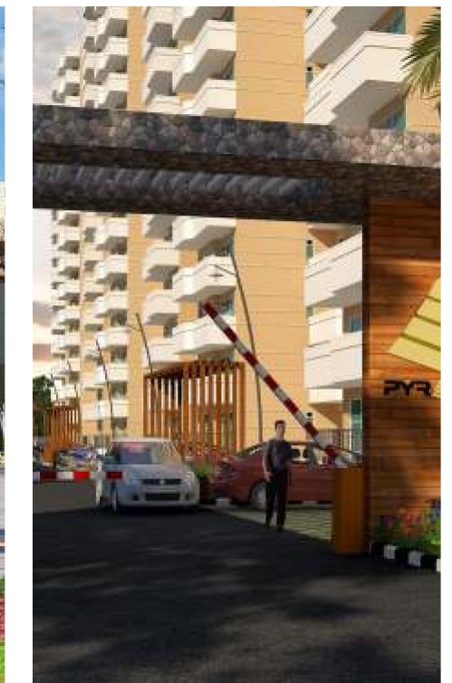
PYRAMID PRIDE SECTOR 76