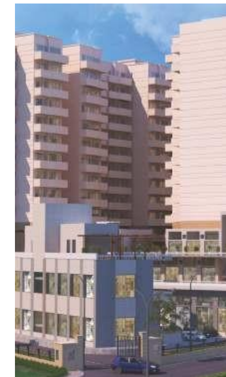
PYRAMID ELITE SECTOR-86