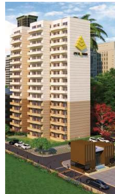
FUSION HOMES SECTOR-70A