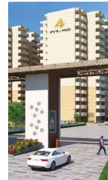
PYRAMID HEIGHTS SEC-85