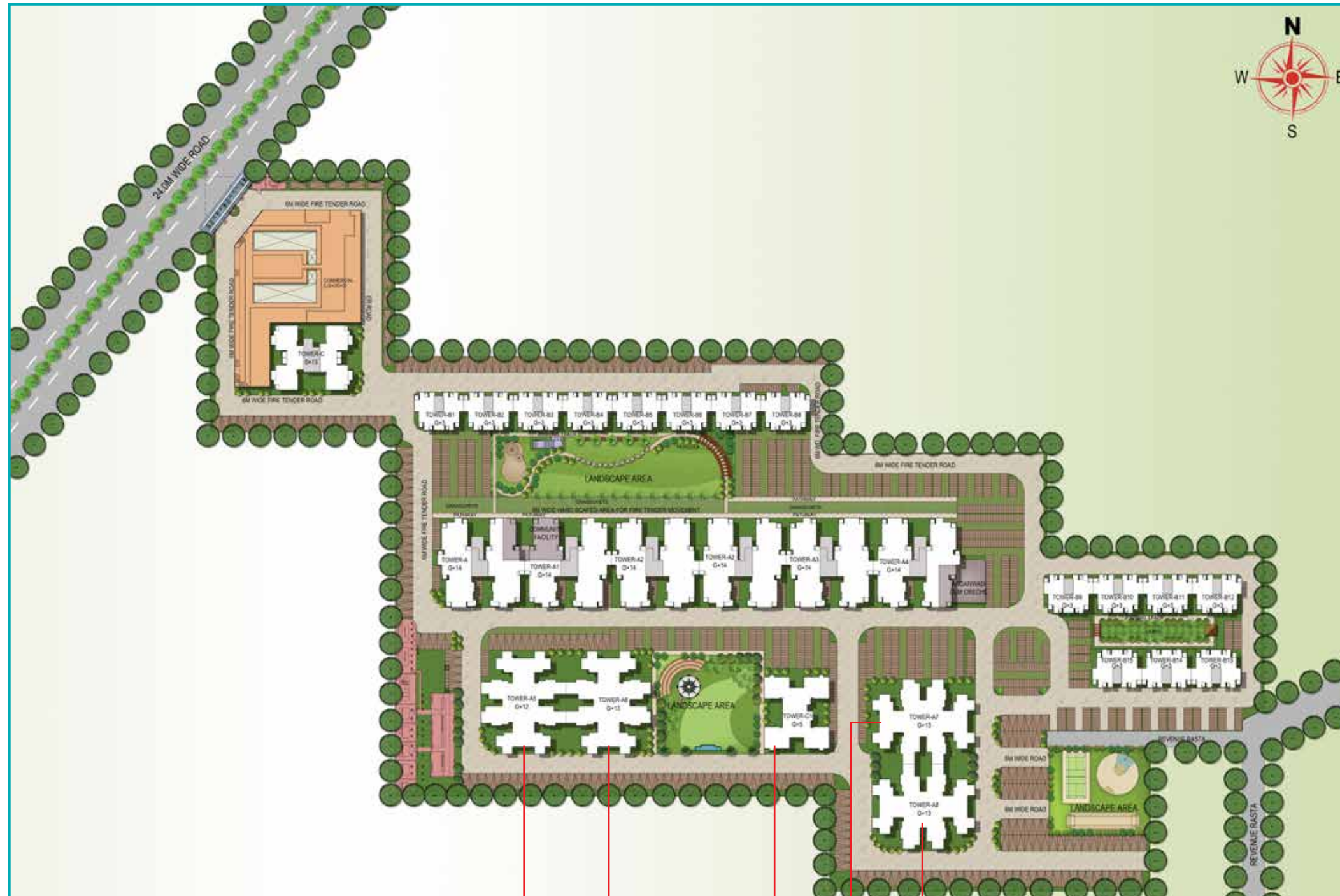
Artistic Site Plan